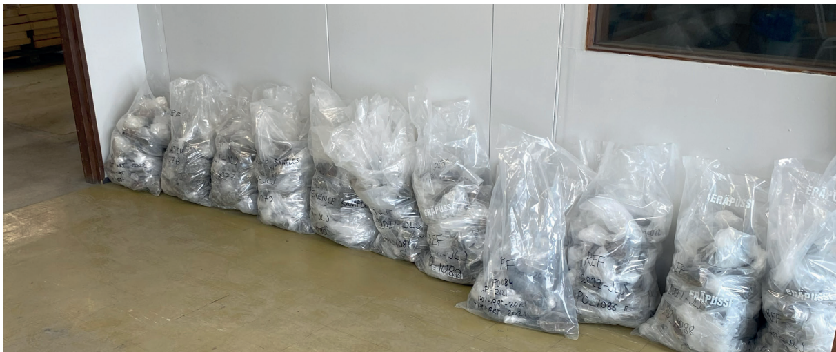
Base-of-till soil and top-of-rock chip samples from 2023 exploration program, ready to be sent to the assay lab. Results will be used to help define core drilling targets.