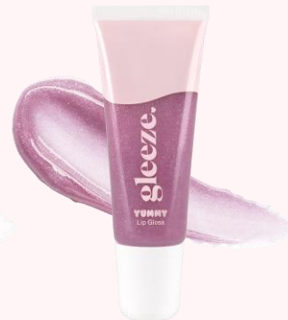
Bubble Yum Bubblegum-scented