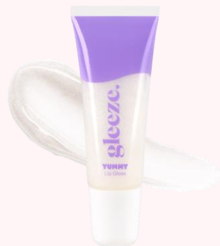
Minty Melt Mint-scented