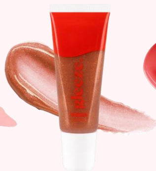
Caramel Coat Caramel-scented