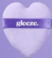
MUSHY Powder Puff