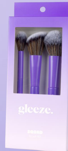
SQUAD Brush Kit