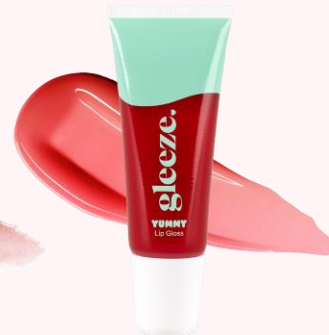
Berry Boom Strawberry-scented.