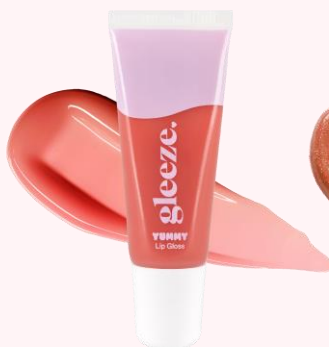
Rare Raz Raspberry-scented