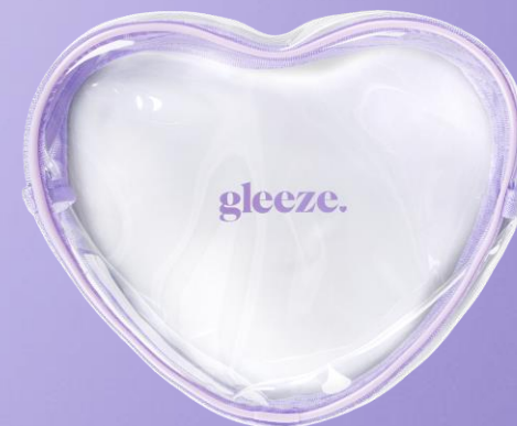
HEART Toiletry Bag