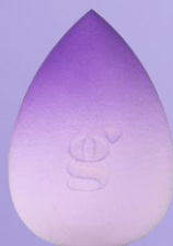
SQUISH Blending Sponge