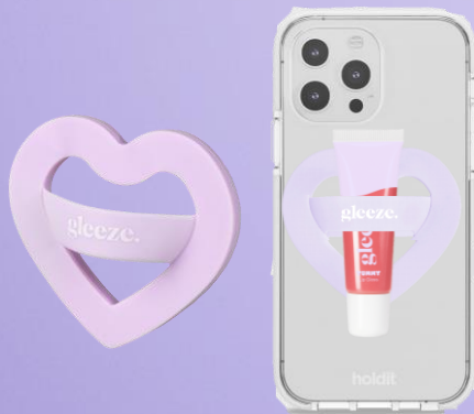
LIP GRIP Holder