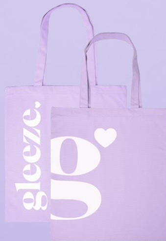
HAUL Tote Bag