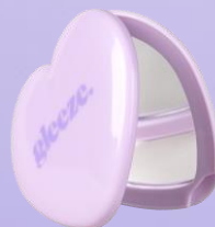
SNAP Pocket Mirror