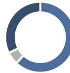
Net revenue split by segment 2023 (%) 1