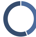
Net revenue split by brand 2023 (%) 1