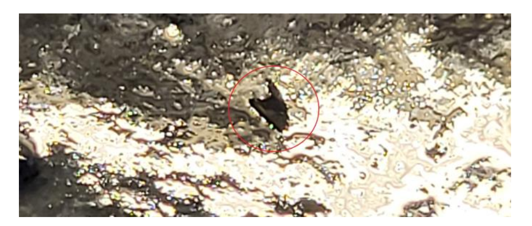
Image of solid carbon decomposed from carbon dioxide in the reactor tubes