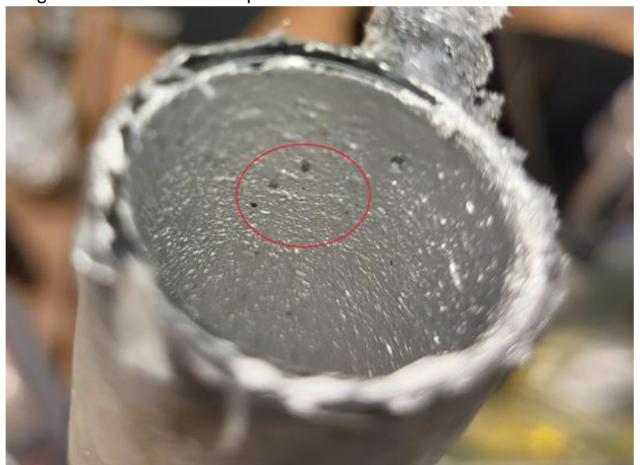
Image of solid carbon decomposed from carbon dioxide in the reactor tubes