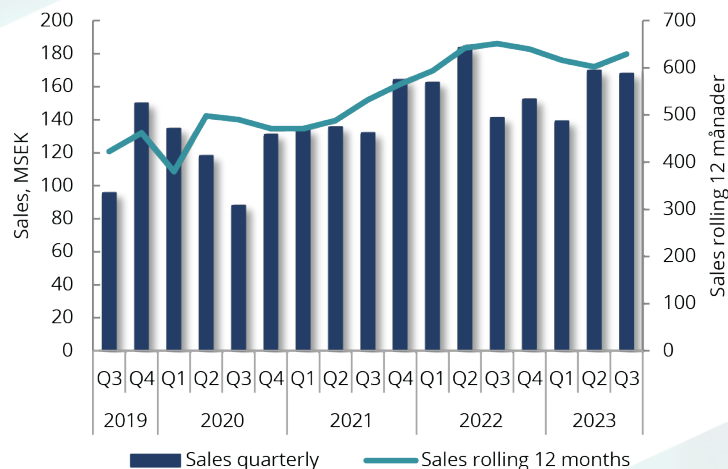
Sales per quarter and rolling 12 months