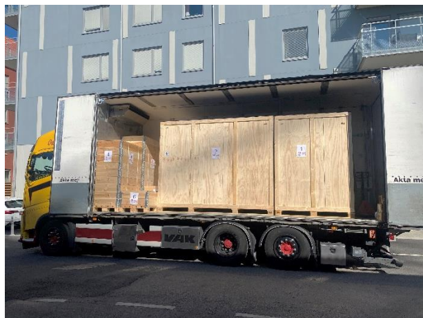
Delivery from Linköping of the coating system for Boyuan in September, only two months following the system order.

Prioritizing the customer, an almost finalized coating system intended for Impact Coatings' new Coating Service Center in Shanghai could be adapted for fast delivery. It was sent to China for installation already during the quarter and then, just after period end, quickly put into production through Managed Services. A new build-project was started of a coating system for Impact Coatings' own operation in Shanghai.