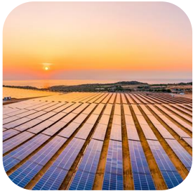
Santa Rosa & Villa Sol