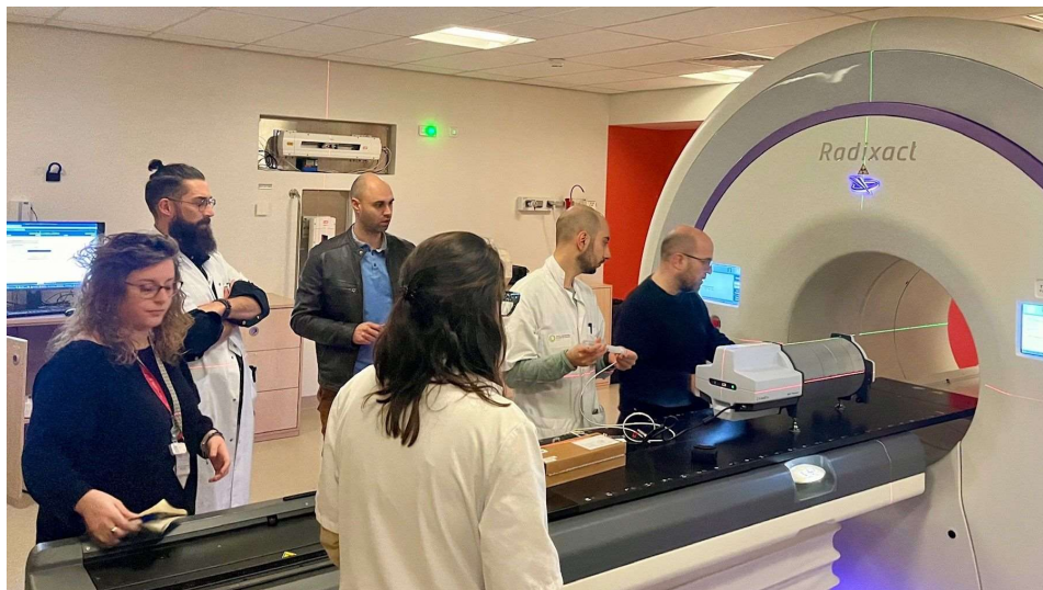
In the fourth quarter, Delta4 Phantom+ was installed at IUCT-Oncopole in Toulouse, France, and will in the future support the hospital's Accuary Radixact system to ensure accurate treatment delivery.

Marketing and sales are managed from the head office in Uppsala and through subsidiaries in the US, France and China. In the remaining countries, some 40 distributors contribute to the company's success.