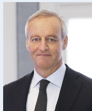
CEO Bure Equity AB

After a weak third quarter, 2023 ended with a sharp rise in the fourth quarter. The SIX RX increased 13.9 per cent while Bure's net asset value per share was up 18.5 per cent. Overall, 2023 was a good year for Bure. Net asset value per share increased 31.4 per cent, compared to the SIX RX which rose 19.2 per cent.