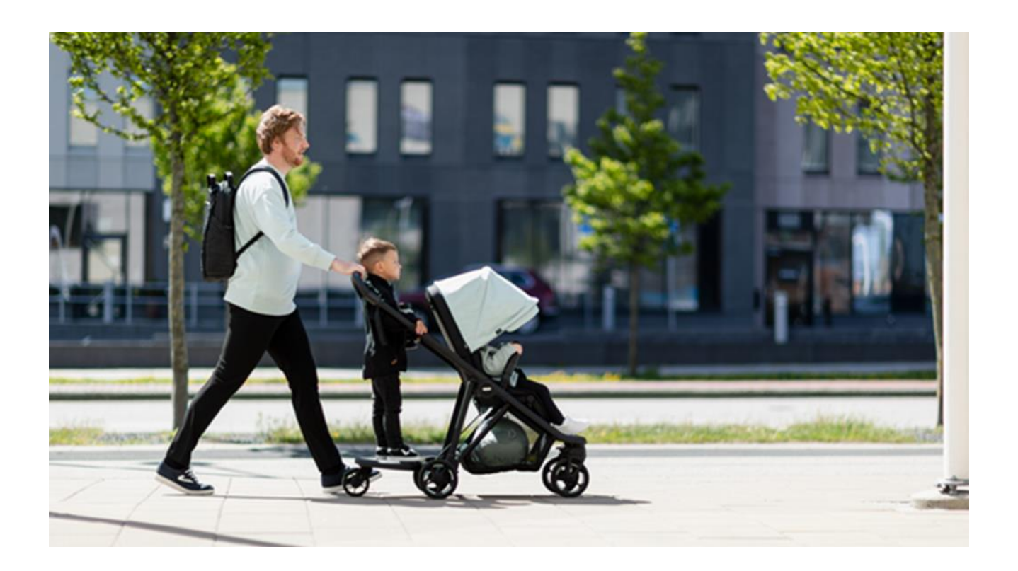
New accessories for four stroller models – The compact stroller Thule Shine was launched in stores at the end of the second quarter. In connection with the launch of our fourth stroller model, an offering of new, practical accessories for all four models was all also launched in new trendy colors.