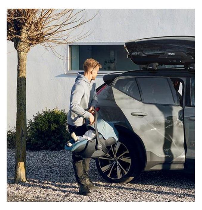
Two new product areas were introduced at the capital markets day on May 11 – At the capital markets day we presented our ambitions for our two new product areas: car seats and dog transport products for cars and bikes. The first products in these market segments will be launched for customers in 2023 and the portfolio will be expanded during the coming years.