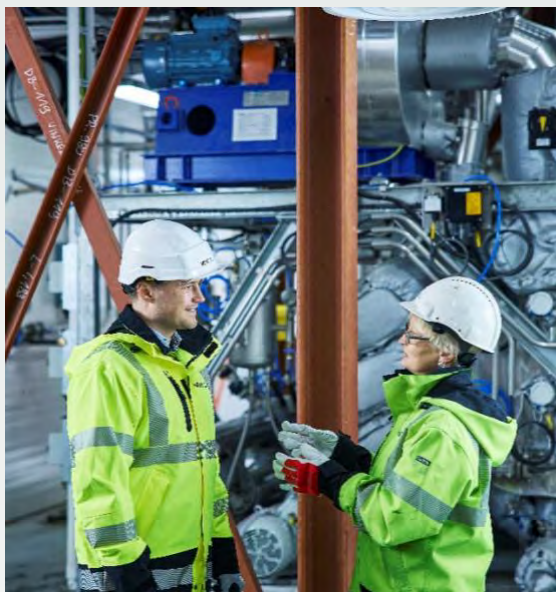
Vow Green Metals' production and test facility entered operations in the first quarter of 2024, and is continuing to ramp up its production capacity

The first half of 2024 was marked by significant industrial, commercial, and financial progress with the commencement of construction of the large-scale biocarbon facility at Hønefoss, the entering of a long-term supply agreement with Elkem and the welcoming of new strategic investors.