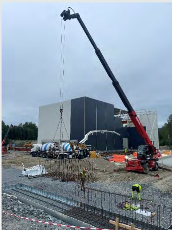
Civil works ongoing. Picture taken in August 2024 showing groundwork in progress for feedstock handling.

decision (FID) of the second phase before year-end.