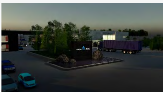
The Viken Park Concept

The Viken Park biocarbon production plant will supply the Viken Park area with bioenergy while producing biocarbon and bio-oil for industrial use, making it a key project in ensuring zero emissions industries in the area.