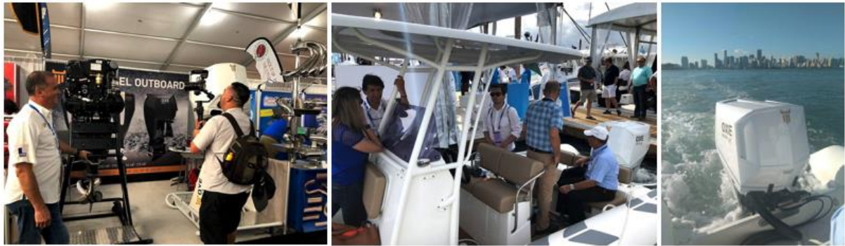
Pictures from Miami Boat Show where Laborde Products Inc (OXE Diesel distributor South US New Mexico to Florida) together with Cimco Marine AB sales representatives displayed the OXE Diesel Kreta both on land and on sea. Generated substantial interest with the YouTube video of around 389,000 viewers.