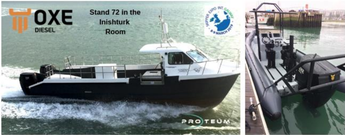
Proteum (UK and IRE distributor) displayed the OXE Diesel mounted on their new Balistic Rib at the Skipper Expo in Galway, 8-9 March.