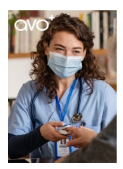
AVO+ fills the void in the market for appealing, well marketed, value-oriented solutions for consumer healthcare. Understanding that consumers prefer products and packaging that has been designed for their environment and use case AVO+ has resonated with consumers in markets across the world with its bright/fresh easy to understand concept.

The Diesel slogan for the brand's DNA from the very start. TLF acquired the licence for Diesel to launch mobile accessories in 2020.Through a long and storied history of strong, iconic, and playful campaigns Diesel has become a leader in advertising as well as in fashion.