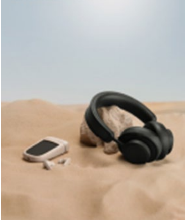
HIP AUDIO ACCESSORIES WITH SCANDINAVIAN DESIGN

Based in Stockholm, Urbanista is a market leader in its region, combining avant-garde design with the latest in audio technology. The products are designed for a life in motion and built to inspire and endure.