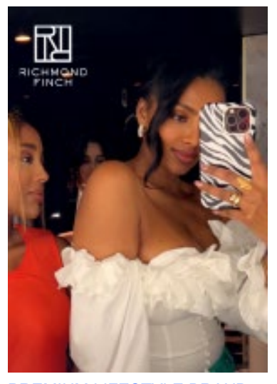
PREMIUM LIFESTYLE BRAND

RichmondFinch is a Scandinavian tech accessories brand. RichmondFinch designs and produces contemporary mobile phone and travel accessories. The unisex lifestyle brand creates unique designs which reflect current fashion trends.