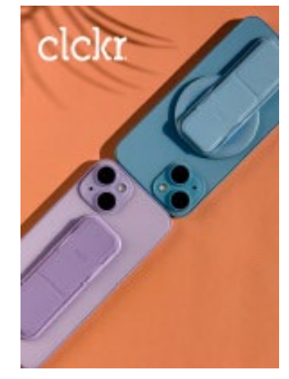
A UNIVERSAL PHONE GRIP AND STAND

Planet Buddies have created a range of kids' accessories based on a variety of colorful characters who represent endangered, vulnerable, and threatened species of animals from all over the world. Their goal is to educate children about the issues that threaten animals with extinction at the same time as offering great and fun products such as headphones and speakers.