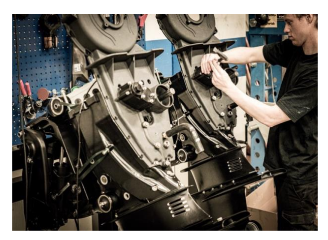
OXE 300 (The Bison project) is going through the validation and verification process which will complete at the end of this year. Here the two` P1As are being built.

Additionally, the company secured a credit facility of up to €14 million with the European Investment Bank. All conditions have been met and the first loan tranche of €4 million is expected to be drawn in early September.