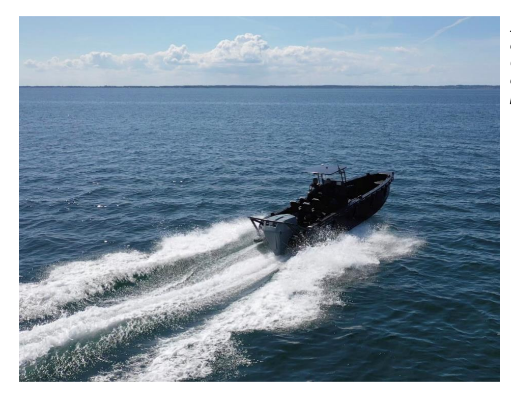
Sea trials and ongoing tests of the OXE300 prototype over the summer period in Ängelholm