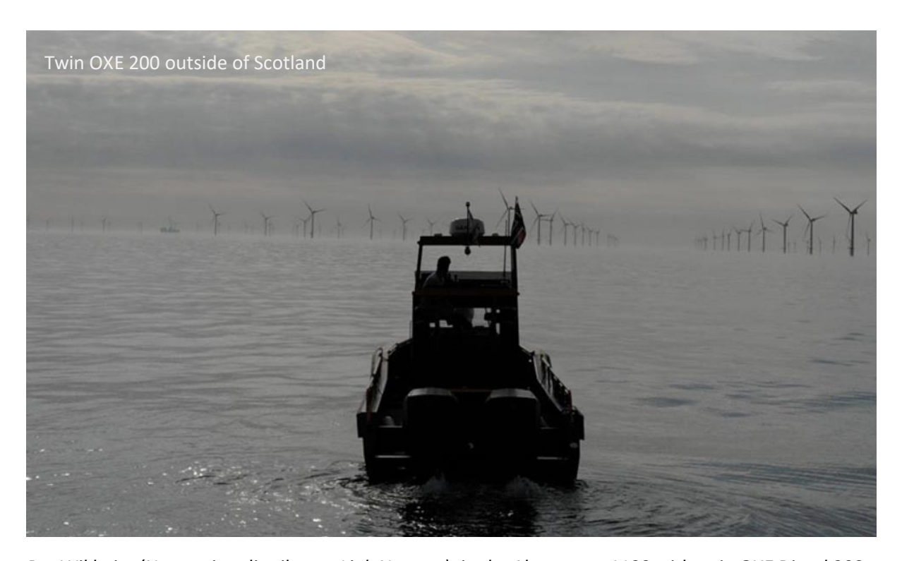
Per Wikheim (Norwegian distributor, Link Norway), in the Aluventure 1100 with twin OXE Diesel 200, outside the coast of Scotland, on the way towards the Norway tour.