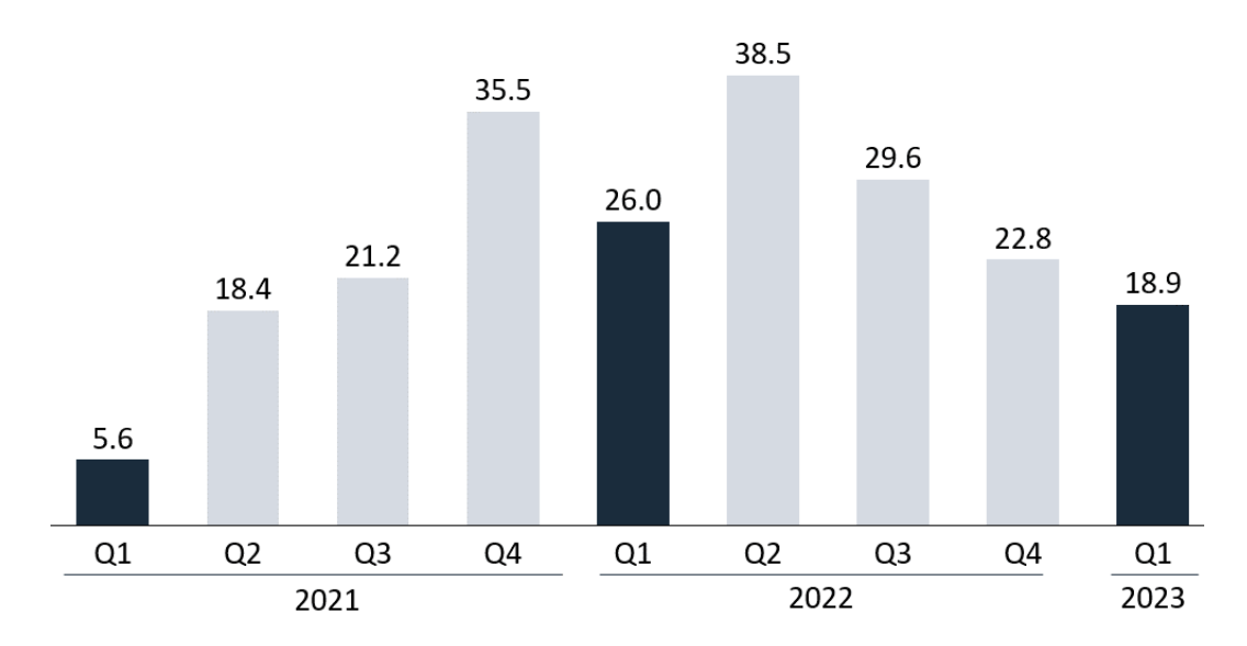
Note: Results from 2022 and 2023 are consolidated, 2021 relate to OXE Marine AB only.

Propulsion sales amounted to SEK 18.9 m on a consolidated basis, a decrease of 27% compared to the same quarter of the previous year. The lower level of sales was as a result of having to upgrade engines towards the end of the quarter which disrupted business.