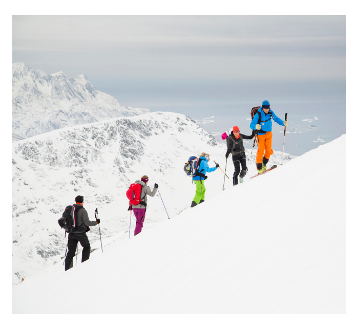
TEN JOURNALISTS AND TWO MOUNTAIN GUIDES TESTING POLYGIENE ODOR-FREE SKI WEAR ON THE BEAUTIFUL ISLAND OF SENJA, NORWAY.