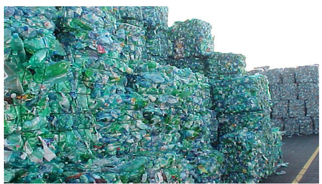
RECYCLED PET BOTTLES BEFORE SINTERAMA TURNS THEM INTO ODOR-FREE YARNS.